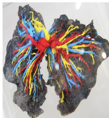
Fig. 3: Showed no separate bronchus, pulmonary artery and pulmonary vein for Accessory lobe. Lower lobe bronchus, pulmonary artery and pulmonary vein were found in the Accessory lobe.

AL – Accessory lobe, ML – Middle lobe and LL – Lower lobe