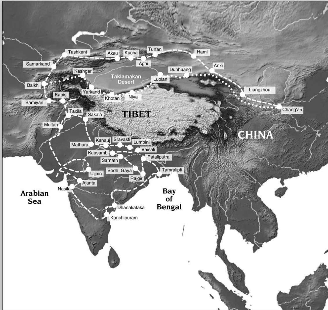
Map 2. Hsuen Tsang's Itinerary.

He came through ‘The Silk Route’ and returned via sea route