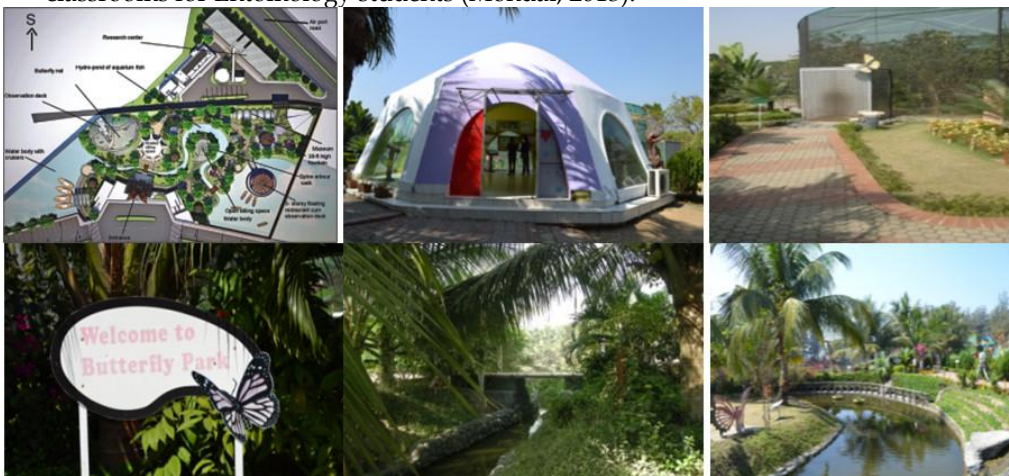
Figure (7): Butterfly Conservation and Research Center, Chittagong

It is located at Potenga, Chittagong [Figure: 7]. Total area is 2-5 acres. It is proposed for a butterfly museum and an insect sanctuary along with the farm and the research center (Mondal, 2013). Initially a 2 acres of land is going to be worked on, and there will be provisions for more expansions of the butterfly farm in the future (Mondal, 2013). This site is a few kilometers away from some of the main tourist attractions in Cox's Bazar and there are also many rest houses and hotels nearby so this could be a nice visiting place as well as a research center with full fledged laboratories and classrooms for Entomology students (Mondal, 2013).