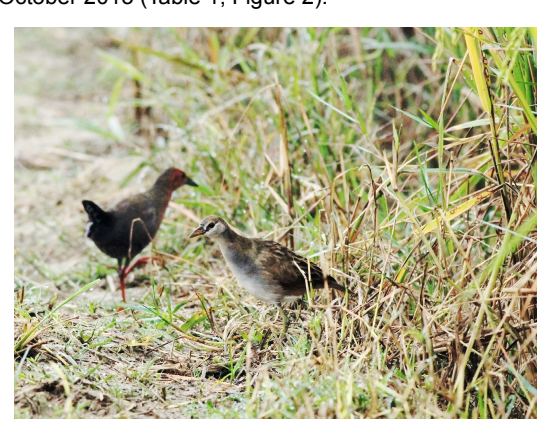
Figure 1 A white-browed crake (right) in Baise, Guangxi, Southwestern China

observed at Honggu reservoir, Ningming Town, Southwestern of Guangxi, China. This sighting was treated as vagrant record, and no photographic evidence was obtained or published. Several months later on 2 February 2013, a sole crake was found and photographed in a suburban pond locating in Baise City, in Northwestern Guangxi Zhuang Autonomous Region. According to this species' typical face pattern and behaviour, it was identified as an adult white-browed crake. Later, one juvenile was found at farmland on 15 November (Figure 1) and another at Longjing reservoir on 24 December 2013 in Baise City, Guangxi. In addition, one juvenile white-browed crake was found by Min Xue, a birdwatcher, in Xichang Wetland Park, Sichuan Province, on 25 October 2013 (Table 1, Figure 2).