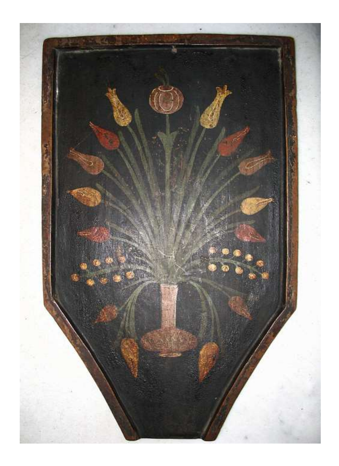
Wooden tray for coins counting. XIX century