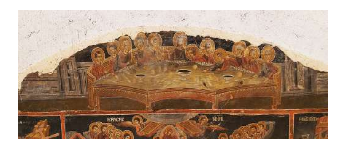
The Last Super, St. George Church, Veliko Tarnovo, XVII century