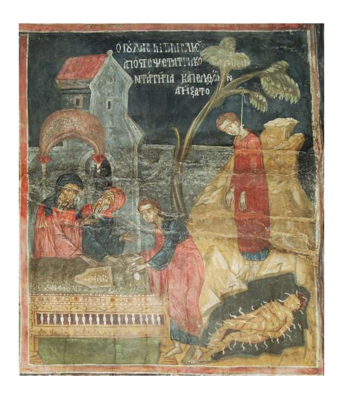
Repentance and self-hanging of Judas Iscariot. St. Athanasius Church in Arbanassi, XVII century