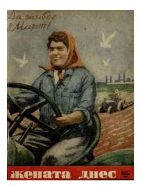
Fig. 6. Zhenata dnes, 1953, No. 2, cover