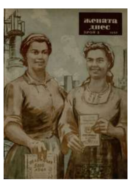
Fig. 2. Zhenata dnes, 1951, No.2, cover

Besides photographic images in magazines particularly relevant stand and screen ones. Especially in the Soviet Union, but not less in Bulgaria stands out image of the woman that embodies the beauty of ordinary people. Therefore, in cinema halls and through weekly newsreel films the regime makes available and live images which it seeks to impose: showing women in their new labor role on the field on construction or in factories. Thus overall is built the image of woman as worker, the image of "masculine girl". The Communist Party is closer to the people and through movies makes acceptable