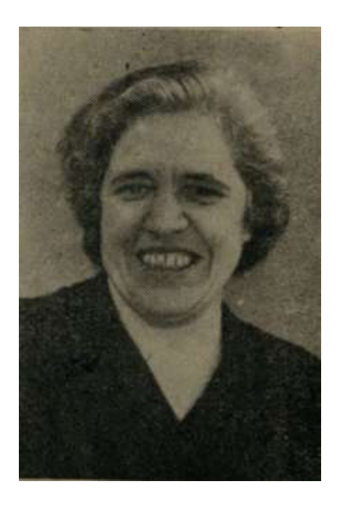
Fig. 9. Zhenata dnes, 1948, No. 5, last cover

basic requirements to clothes are to comply with the requirements of everyday life in general. Socialist fashion does not seek to draw attention to it, but only to serve the communist person in the performance of his public duty and tasks (Стойков, 1982, сс. 51-52), fashion should be used for the purpose of socialist society. Bulgarian socialism refrained from resorting from propaganda of fashion. To a minimum are kept women's ability to earn only thanks to the attractive vision.<sup>21)</sup>