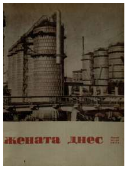
Fig. 1. Zhenata dnes, 1951, No.11-12, cover

raised tractor drivers, responsible combine-operators or steel workers - they appear on magazine's cover deserved (Figs. 4-6). They are the muse of poetry to Bulgarian poets<sup>9)</sup> The magazine is a medium of state's ideology - a true exponent and organizer of the progressive women's movement. Print media begin to serve newly identified concepts. But this means that the individual approach is not tolerated and even the chief editor of magazine "The Women Today" does not have the right to impose her own view.<sup>10)</sup>