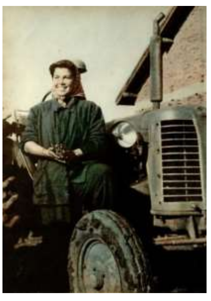
Fig. 4. Zhenata dnes, 1956, No. 2, last cover