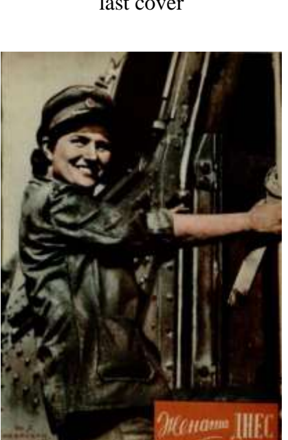
Fig. 5. Zhenata dnes, 1955, No. 2, cover