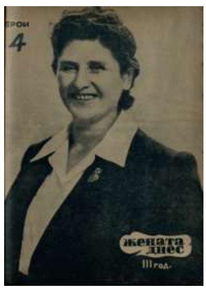
Fig. 7. Zhenata dnes, 1948, No. 4, cover

but also they are an example for exemplary look of the socialist woman - gathered hair, following the guidelines of Georgi Dimitrov - "woman to be neat and not disheveled, messy like a scarecrow." Women were dressed in gray, brown and beige suits with high collars and long skirts having cold asexual irradiance.