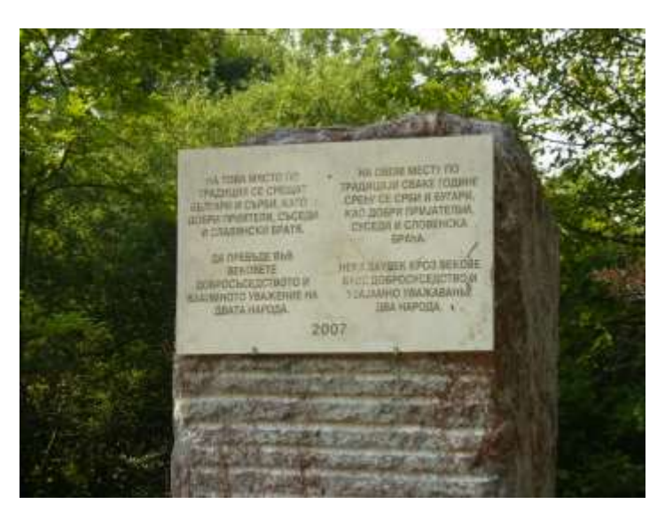
The fair place

during the fair which re-emerged at 2001. Every year since 2001 every third week of July a three-day trans-border fair is held.