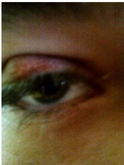
Figure1: Superior right eyelid - redness, swollen, hard nodules and linear perilesional hypo-pigmentation caused by Kenalog-40.

On examination, the superior portion of his right eyelid was erythematic and swollen, as well as warm and hard to palpation nodules (Figure 1).