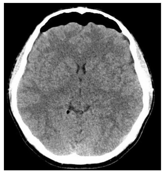
Figure 2: Symptomatic pneumocephalus in axial cranial CT obtained in postperative period.

very large midline disc. Bilateral hemilaminectomy was performed due to the midline disc. Dura injury was observed on the ventral surface when left discectomy was being performed. A certain amount of CSF leakage was observed just after the dura tear and it was seen to stop spontaneously after a while. A sponge was placed and no other treatment was performed (as Tissel). An unsettled vacuum suction device was placed under the fascia on the left considering that a future CSF fistula might develop as bilateral hemilaminectomy was performed, and abundant haemorrhage developed during discectomy. Fascia and subcutaneous tissue were tightly sutured. A total of 200 cc CSF-blood mixture was seen to flow from the vacuum suction device of the patient who had bed rest for two days. The patient was mobilized on postoperative day two and, experienced headache and nausea, vomiting, but he did not have a stiff neck or fever, so infection was not considered after evaluation by an infectious diseases specialist, and bed rest was recommended again. Cranial and lumbar computed tomography (CT) was obtained on postoperative day four. When his complaints cranial continued, CT revealed intracranial pneumocephaly (Fig. 2) and lumbar CT revealed air under profound fascia and at the wound site (Fig. 3).