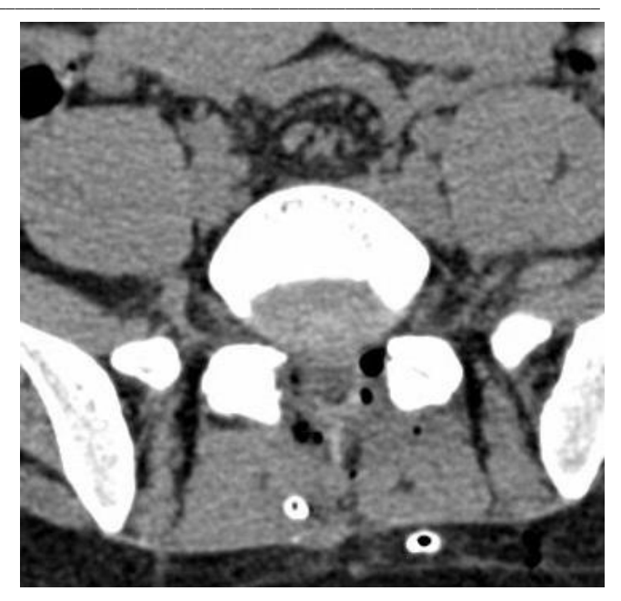
Figure 3: The appearance of the air in laminectomy field and the under-fascia part of the lumbar vacuum suction device on postoperative lumbar CT.

The vacuum suction device was removed on postoperative day five as no flow or wound problem was observed and the skin was sutured. The patient's complaints completely regressed on postoperative day six and he was discharged on postoperative day eight.