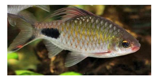
Figure 1: Rasbora Daniconius

A series of experiments were conducted to assess the effect of factors influencing the motility, viability and preservation of spermatozoa of selected freshwater fishes. The fishes used for the study are Rasbora daniconius, Puntius filamentosus, Parambassis dayi and Hyporhamphus xanthopterus (Figs. 1, 2, 3 & 4). Fishes were collected from Vellayani Lake in Trivandrum district of Kerala.