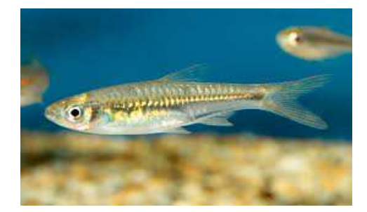
Figure 2: Puntius Filamentosus