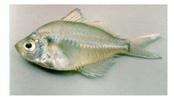
Figure 3: Parambassis Dayi

Factors Affecting Motility, Viability, Short and Long Term Preservation of Spermatozoa of Four Species of Indigenous Ornamental Fishes