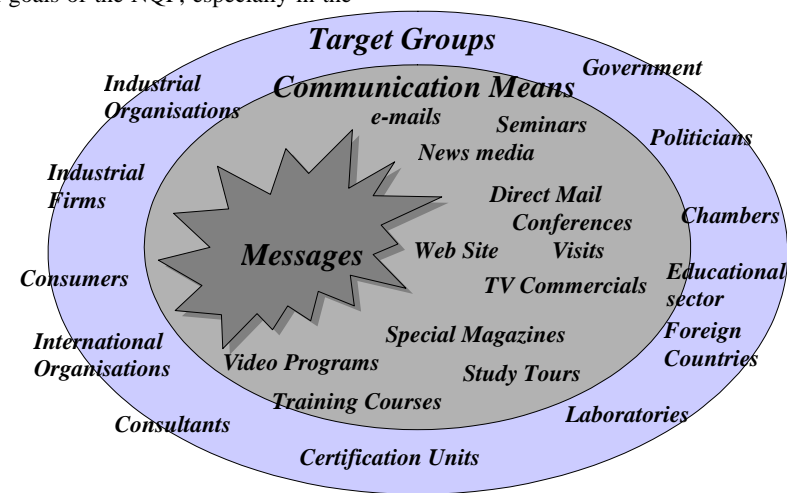
Figure 2. Main Elements of the Quality Awareness Campaign - Communication Means and Potential Target Groups

A Quality Awareness Campaign aims at creating an understanding of the need for quality improvement in the industrial society as well as among Serbian consumers. At the same time, it constitutes a sustained effort and a vehicle to communicate institutional and legislative changes to all stakeholders and to facilitate a dialog among these stakeholders about how to define and implement these changes. The main elements of the Quality Awareness Campaign are shown in the Figure 2. This Campaign should have two phases. In the initial phase, activity level is high, comprising activities such as the creation of an information network and an information package, establishing of databases. development of an Internet web site etc, while in the continuation, the information network is used in the day-to-day interaction with the users group.