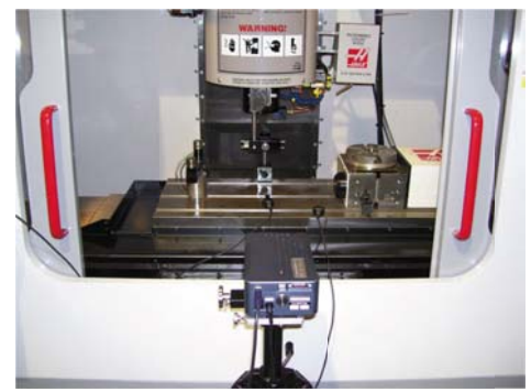
Figure. 3 Measurement using Laser interforometer

Measuring is always carried out on unloaded machine. Measuring period depend on machine type and number of measured planes.