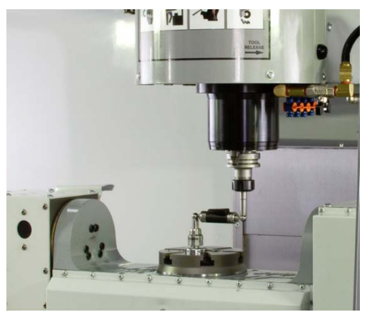
Figure 4 Measurement of geometrical inaccuracy of CNC machine tool

Greatest benefits may be looking for as well: