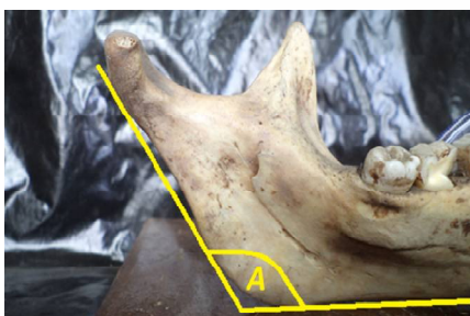
Fig. 1: Angle Of Mandible (A).

Angle of mandible ( Gonial angle): The mandible was placed on the Mylometer with the condyle, the base of the mandible, and a point on the ramus in contact with the device. The mandibular angle was read on the protractor without moving the bone (Figure 1).