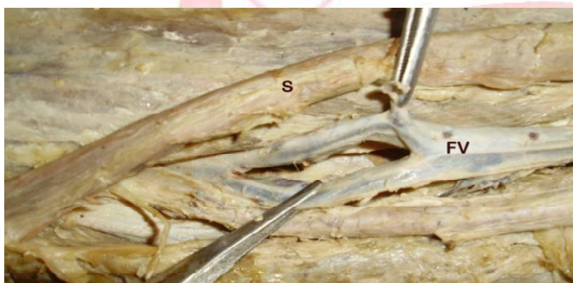
FV- femoral vein, FA- femoral artery, QCF- Quadriceps femoris