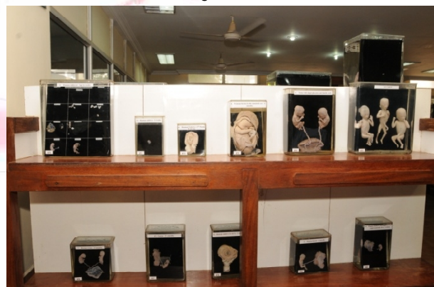
Fig. 4: Embryology Section: Section Shows Foetuses at Various Stages of Gestation.