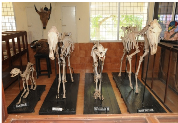
Fig. 2: Comparative Osteology Section.