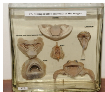
Fig. 1: Comparative Anatomy of Tongue.