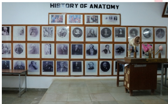
Fig. 3: History of Anatomy Section Showing Eminent Anatomists.