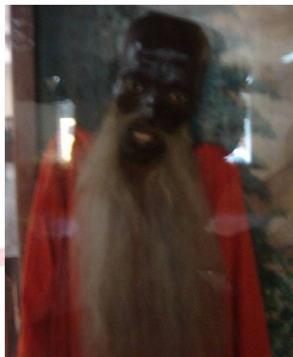
Fig. 7: A Mummy Section Makes the Museum More Attractive.