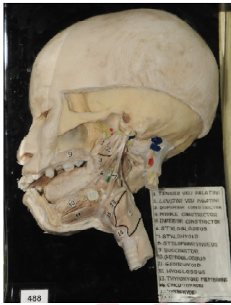
Fig. 9: A Well Dissected and Labelled Specimen.