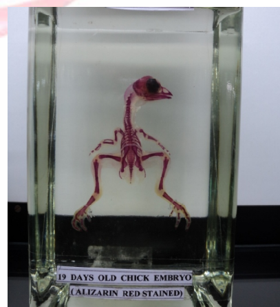
Fig. 8: Osteology Section with Alizarin Stained Embryology Specimens. Alizarin Stained Chick Embryo is Shown.