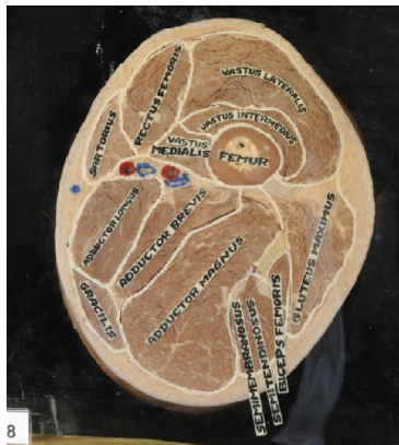
Fig. 5: Crosssectional Anatomy of Thigh.

Section at the level of apex of femoral triangle.