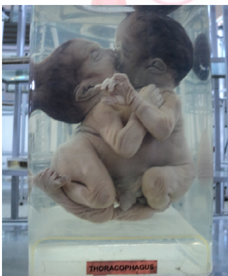
Fig. 6: Teratology section showing embryological defects and abnormalities.