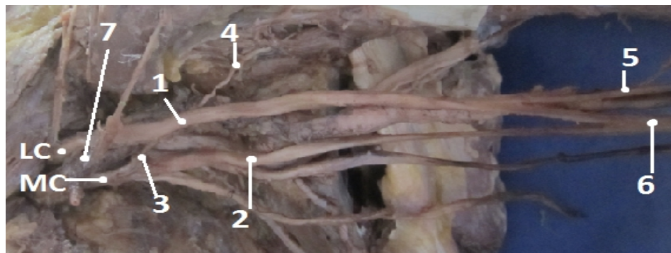
Fig 1: LC,MC-Lateral and Medial Cord of brachial plexus.

1- lateral root of Median nerve, 2- medial root of median nerve, 3-3 rd root of median nerve, 4- br. To coracobrachialis, 5- common trunk, 6- Median nerve, 7- 2 nd part of axillary artery.