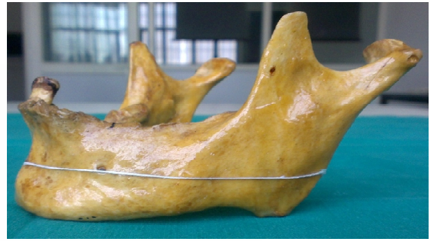
Fig. 3: Position of Mental Foramen & its size calculated by transverse measurements of mandible in relation to borders.

The transverse diameters were measured by using various parameters viz., the distance from the symphysis menti, the posterior border of the mandible, the base of the mandible and from the alveolar margins by use of digital vernier caliper. Thread was placed on reference point A and B and cut the thread at point B, placed the thread over Glass Slab, such that complete length of thread is in a linear shape and measured the two end of thread. This has given the measurement of mandible from symphysis menti to the anterior margin of mental foramen.