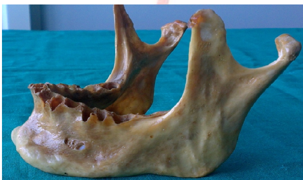
Fig. 5: Left side of a mandible showing two mental foramen. MF-Mental Foramen and AMF-Accessory Mental Foramen.

by single observer to avoid any inter-observer error. The SPSS, version 16.0 software were used for the statistical analysis, to find out the minimum and the maximum incidences, the mean and the standard deviation. For the accessory mental foramen, the number, location, shape, size and the orientation were recorded (Fig-5).