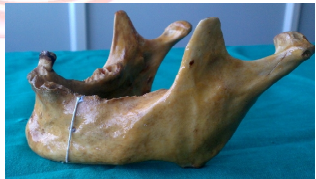
Fig. 4: Position of Mental Foramen & its size calculated by vertical measurements of mandible in relation to borders.

Similar method employed for measurement of the reference point CD, AD, EF, GH and EH.