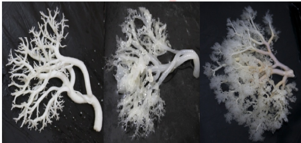
Type III: Inferior segmental artery.