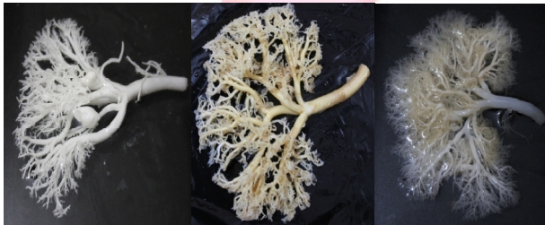
Type IV: Inferior segmental artery.