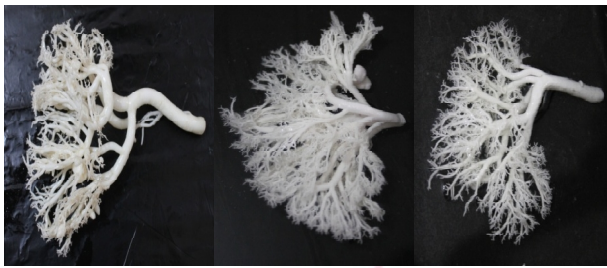
Type II: Inferior segmental artery.