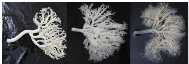
Type II: Posterior division of renal artery.