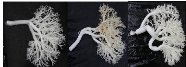
Type II: Posterior division of renal artery.