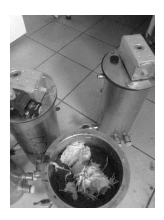
Figure 1. Batch anaerobic digestion with pre-treated chicken feather

The anaerobic degradation was examined in the Biodegradation Laboratory of the Institute, where the fermentation areas were 4 stainless steel digester (the volume was 6 l per each) in Incubators. The batch experiments were carried out at mesophilic conditions (38°C) 30 day. Mesophilic liquid digestate (2.2 kg), corn silage (0.2 kg), cattle slurry (2.6 kg) and pre-treated feather (0, 5, 10, 20%) was added to the batch digesters (Figure 1). All experimental setups were performed in triplicates.