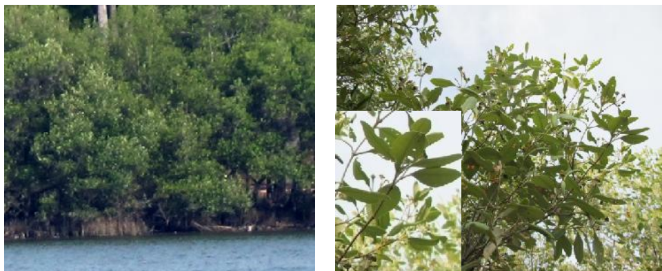
Figure 2. Coverage shape and characteristics of mangrove a. Avicennia marina with close coverage along the lake shore b. Oval leaf tip shape with white lower leaf surface is the diagnostic character of A. marina .

salt water lake of Gili Meno also offer animal resource for migratory bird feeding. The mangrove ecosystem ability to maintain the stability and fluctuation of salinity and temperature causes fresh water species capable to adapt in the saltwater habitats. From the results of fishing using fishing nets and rods it was found that only one species of fish inhabit the whole habitat of the salt water lake. The identified species is Mujair fish ( Oreochromis mossambicus ). As indicated by Kosztowny et al (2008), this fish species can adapt well in salt water from juvenile. This is because of its ability to activate ATPase anzyme to maintain cell membrane activity, especially on the gill rakers to keep active despite the high salinity. Further research to identify other animal species which is potential as feeding resource for migratory birds is of high importance. Moreover, research on the histological and anatomic differences of Mujair fish from salt water and fresh water is required.