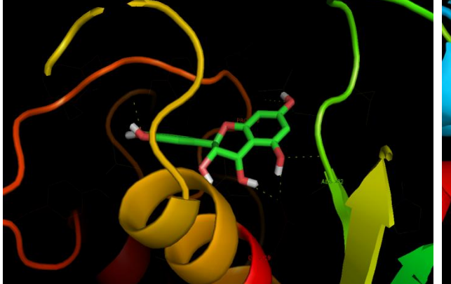
Fig. 1a. Molecular docking study of collagenase with leucocyanidin