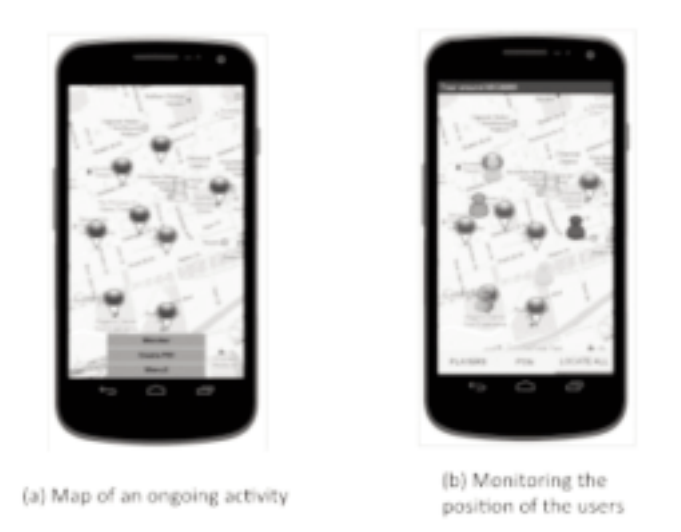
Figure 4. Monitoring an activity

The cross arrows in the POIs allow the organizer to reorder the POIs in the itinerary. When the organizer presses the «Edit» or «Add new Point Of Interest» button, this POI expands to gather the information related to this POI. The organizer must provide a title for the POI and, as an option, a photo, a video, a description and a geocoded place name (e.g., «Paseo de la Castellana, 163 28020 Madrid»). This geocoded place will be converted to its GPS coordinates using forward geocoding.