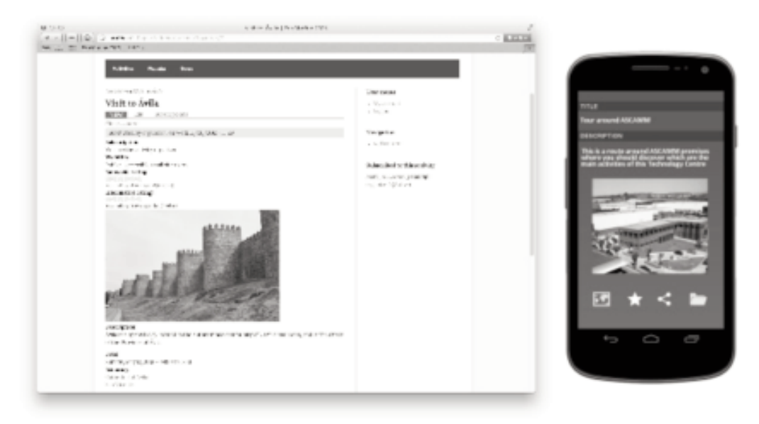
(a) The CMS

Regarding the user profile, EduMotion defines three roles (authenticated user, organizer and administrator), valid for both the CMS and mobile app, and each of which corresponding to a set of fixed permissions that depend on these roles. Normally, users participate with the authenticated user role. As all registered users receive the authenticated user role, normally they do not need further intervention from the administrator of EduMotion. However, some users need to receive further permission to play additional roles (in particular, the organizer and administrator roles). The users with the organizer role can create activities. The users with the administrator role can grant additional roles to other users and manage information associated with the user's account.