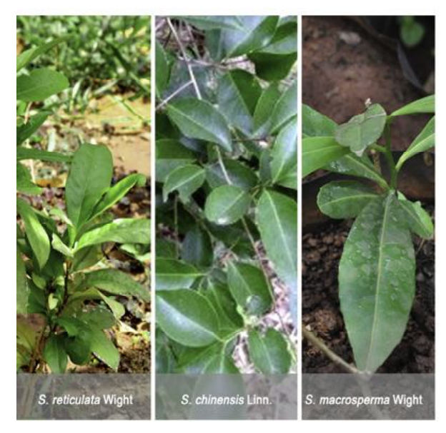
Figure 1: Different species of Salacia