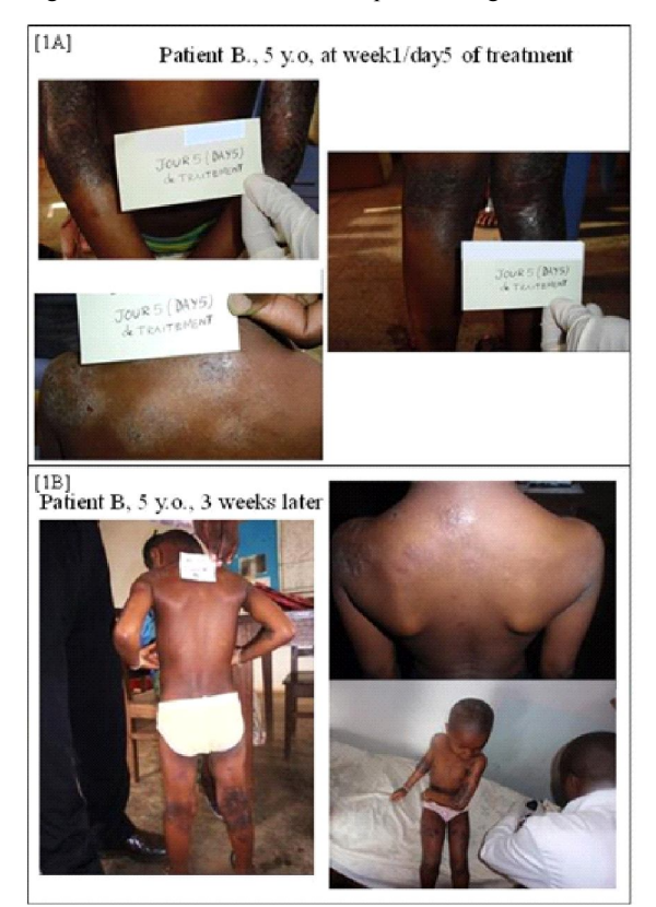
Figure 1A: Affected body areas at day5 (week1) (a) and at day21 (b) after starting topical treatment with 10% Vamex (Vernonia amygdalina leaf extracts) in a 5-year old Congolese girl

The patient condition got worsened possibly due to lack of adherence to previously prescribed treatments (steroids) rather than their ineffectiveness, which might have made her condition recalcitrant. Furthermore, the use of plant materials that had no proven efficiency by traditional practitioners and healers could have aggravated skin lesions that we observed at the time of patient's admission. Though there were a few dyschromic spots on her lower limbs remaining after 8 weeks of treatment, our patient's condition improved considerably and no adverse effect was noted. An improvement of the country's health system and provision of specialized health care in the rural areas could help prevent misdiagnosis of treatable diseases in poor settings.