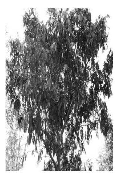
Figure 1: Saraca asoca (Roxb.) de Wilde

Hence, this tool can be effectively employed for the quality evaluation of raw drug of asoka bark. This study demonstrates the potential of TLC technique as a rapid, easy and cheap fingerprinting tool for the authentication and quality assessment of the important raw herbal drug asoka bark and also to screen the commercial samples for adulteration. This study also confirms wide adulteration in Kerala market samples.