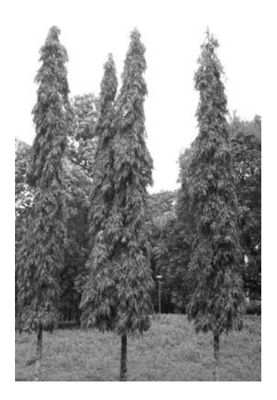
Figure 2: Polyalthia longifolia (Sonn.) Thwaites