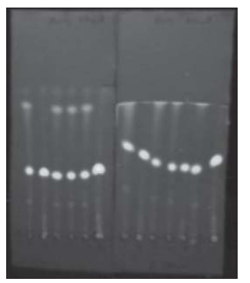
Petroleum ether extract Mobile phase - Benzene: Ethyl acetate (9.7:0.3) Sprayed with Antimony trichloride Reagent and heated at 90° C for 5 minutes