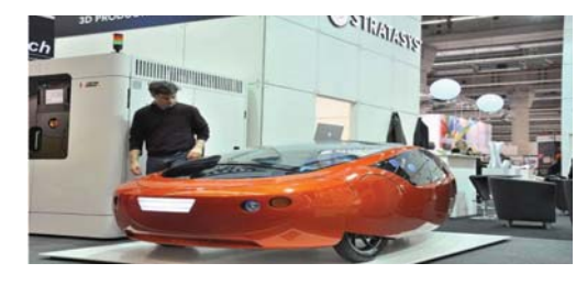
Fig. 4. This is the first car, manufactured by means of the 3D-printer

However, this problem, too, can be resolved through the digital production.