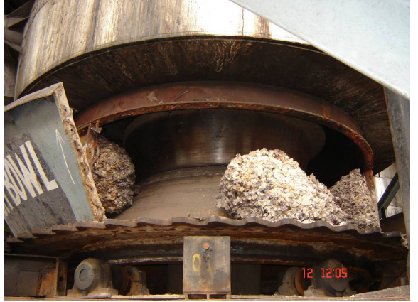
Figure 1: Ash bowl arrangement with guide roller

The Oil, natural gas, raw coal, LPG firing could have been an ideal source of energy if only the oil prices had been within the range that was prevailing in sixties and earlier. But from midseventies onwards, due to global energy crisis, the prices of various petro fuels jumped up by leaps and bounds and the oil intensive industries in the country are now in a total jeopardy with respect to erosion of their profitability. Crushed coal of the specified quality and size is carried to the top of the bunker by means of Bucket Elevator and is put to the bunker. Coal from the bunker is fed into the Extended Shaft of the Gasifier through a Sector Gate and two Bell Cones operated by pneumatic power cylinders which open out the Sector Gate and Bell.