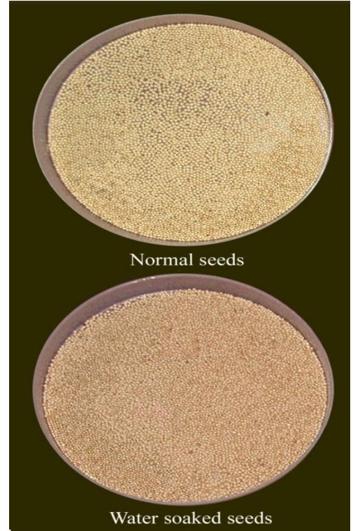
Figure 2. Influence of rain soaking on seed colour of grain amaranthus

certification standards, many a time it may not be acceptable as seed for sowing because of poor physical appearance and highly expected incidence of seed borne fungi. In agricultural crops like sorghum and pulses also researchers have mentioned about this rain soak injury and expressed that the seeds should not be selected for seed purpose in these situations expressed that seed coat colour as the unique genetic factor that varies with crop in most cases and sometimes with varieties.<sup>[7]</sup> But this genetic colour could be altered to some extend for their varying shades due to the changes in the environmental conditions or seed developmental stages or fungal attack. The colour of grain amaranth seed that soaked in rain was orange white group159D while the normal orange white group 159B of seed as per Royal Horticultural Society Gardens guidelines.