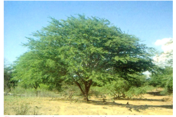
Figure 1. Habitus and environment of P. juliflora in Sudan, Africa.