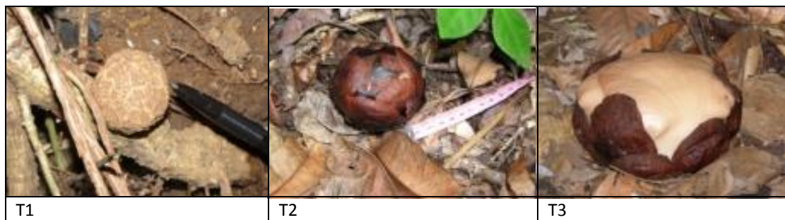
Figure 3. Development of R. patma from bud to the beginning of flower opening during the period of December 2004 and September 2005 at the Pangandaran Nature Reserve.

The Rafflesia seems very sensitive to disturbance caused by the presence of investigators as indicated by many buds failed to grow further and died at different stages of bud development. New buds, mature buds or flowers of R. patma were found at any time of the year, but the natural mortality rate was observed to be very high also. It is implied that a demographic study in their natural habitat could be biased by presence of the researchers.