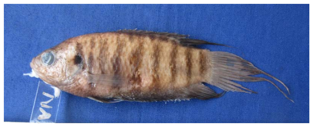
Fig.3. Macropodus opercularis (Linneaeus, 1758).

Macropodus opercularis is distinguished from other species of Macropodus by the following combination of characters: caudal fin forked; conspicuous dark brown opercular spot with whitish posterior margin (margin red in life); body with 7 - 11 bold, dark bars on pale yellowish background in preserved specimens (blue bars on reddish background in life); dark stripe crossing eye connecting opercular spot with eye; top of head and predorsal body with dark spots; posterior tip or margin of scales on body not darker than scales.