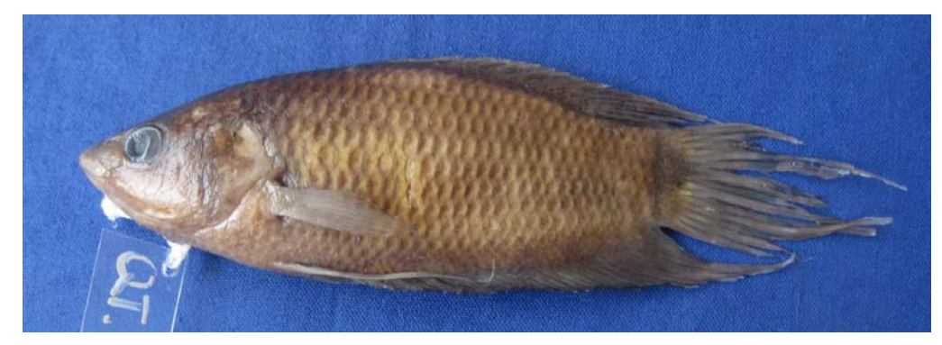
Fig.2. Macropodus erythropterus Freyhof & Herder, 2002.

Macropodus erythropterus is distinguished from other species of Macropodus by the following combination of characters: caudal fin forked; opercular spot pale or missing; spots and bars on dorsal and caudal-fin membranes brown, red in life; soft rays in unpaired fins pale brown; predorsal and subdorsal back reddish and body above anal fin base iridescent blue to green in life; body with 10 - 12 faint and inconspicuous dark bars; top of head and predorsal body without dark spots; posterior tip or margin of scales on body conspicuously darker than scales; distal part of first soft pelvic-fin ray red in life.