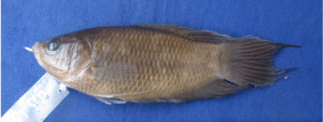
Fig.4. Macropodus spechti Schreitmüller, 1936.

Macropodus spechti is distinguished from other species of Macropodus by the following combination of characters: caudal fin forked; opercular spot pale or missing; body without dark bars or with 4 - 12 faint and inconspicuous dark bars on pale brown to dark greyish background in preserved and live specimens; top of head and predorsal body without dark spots or saddle-like blotches; posterior tip or margin of scales on head and body conspicuously darker than scales; distal part of first soft pelvic-fin ray red in life; spots and bars on dorsal and caudal-fin membranes black; posterior dorsal-fin membranes and caudal-fin membranes blue in life; filamentous caudal-fin rays with white or black posterior extremity.