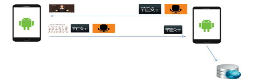
Figure 1. Architecture Diagram