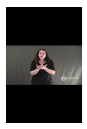
Figure 5. Text to Video display for deaf

The sign language recognition can be implemented through our project by giving a link to the particular web server. Intent can be used implicitly to get the video as the output in the users mobile phone. The request is given to the server and is hit to the server with get and post method, where the output is received as the String and converted to the video. This completes the module and gives a way to communicate between deaf and the hearing party.