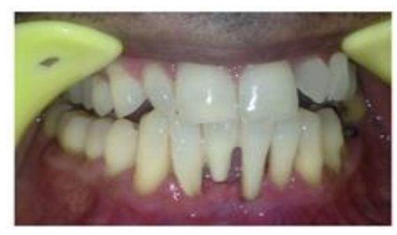
Fig. 6: Post Operative after 4 Weeks