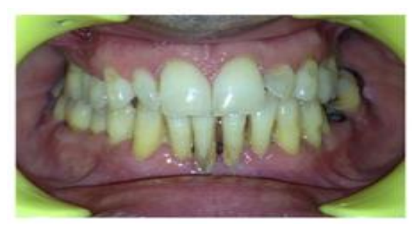
Fig. 1: Before SRP

This immediate provisional restoration allows for exact repositioning of the coronal part of the extracted tooth in its original intraoral three dimensional position and thus relieves the apprehension of the patient caused by the sudden loss of an anterior tooth. Thus this procedure to a great extent helps in regaining esthetics and providing patient satisfaction. Appropriate patient education and instruction to clean the gingival embrasures and avoid having heavy bite is very critical and important.