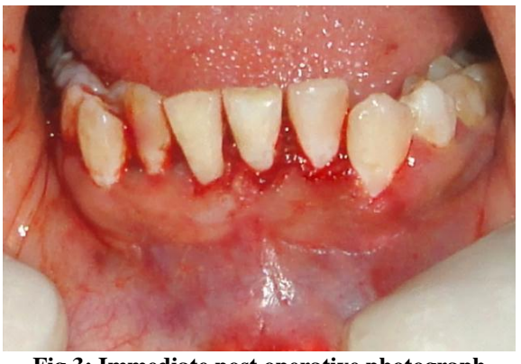
Fig 3: Immediate post operative photograph