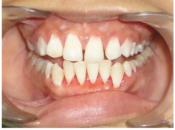
Fig 5: 2 months post operative photograph