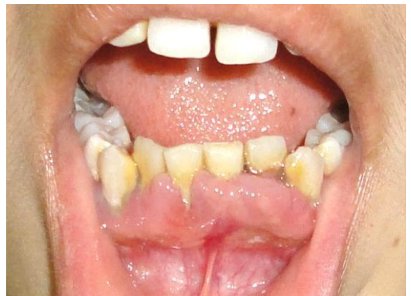
Fig 1: Pre-operative intraoral photograph

cellular connective tissue showing diffusely spread increased chronic inflammatory infiltrate mainly composed of plasma cells and lymphocytes with numerous blood vessels. The features were of inflammatory fibro suggestive epithelial hyperplasia. The patient was given antibiotic and anti-inflammatory drugs TDS for 5 days, and chlorhexidine mouthwash twice daily for 3 weeks. Post-operative oral hygiene instructions were given and the patient was recalled after 10 days for reinforcement of oral hygiene. Patient was recalled at frequent intervals for the next 2 months which showed uneventful healing (Fig 5).