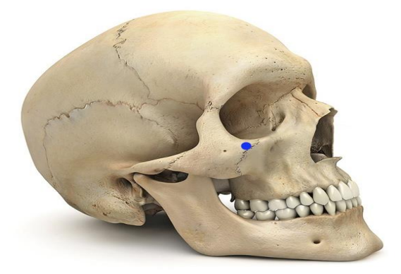
Fig. 1: Centre of Resistance of Maxilla