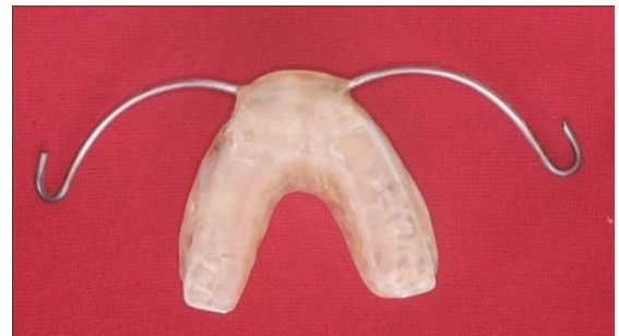
Fig. 2: Intra Oral Splint