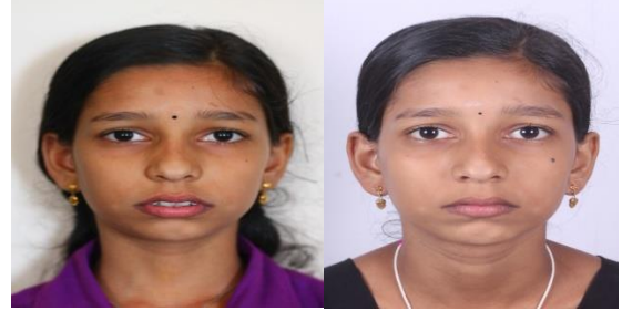
Fig. 6: Frontal View-Pre and Post Treatment Photographs