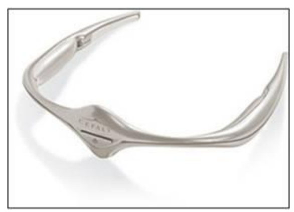
Fig. 1: Device Cefaly®

Cefaly® is a device that neuro-stimulates the skull. Initially, the pain relieving cranial neuro-stimulation was only possible by complex, bulky and expensive equipment as the bones of the skull and the sinuses are very sensitive.(Figure:1) Cefaly® is an innovative, handy, modern yet simple light weight economical device that alleviates the sufferings of migraine patients leading to non-pharmacologic and non-dependent good quality of future life. Cefaly® is the first cranial analgesic electrotherapeutic device to acquire ISO medical certification proven effective on migraine pain with no side effects. Cefaly® is based on TENS technology which is known for its safety hence it is unique in comparison to other methods of headache and migraine pain management.