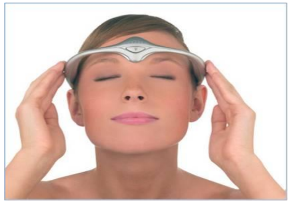
Fig. 2: Position the device in the center of the forehead, just above the eyes, using a self - adhesive electrode.

It is manufactured by STX-Med in Herstal, Liege, Belgium and is a small, portable, battery-powered, prescription appliance that resembles a plastic headband worn across the forehead over the ears. The device needs to be positioned in the center of the forehead, above the eyes using self -adhesive electrode. (Figure: 2) A low intensity electric current is delivered onto the forehead and underlying tissues that stimulates branches of trigeminal nerves associated with migraine headaches. (Figure: 3). Clinically the device has been studied upon for over five years in various university pain clinics and laboratories and has been developed conforming to stringent compliance with ISO and IEC standards applicable to medical devices/equipment.<sup>10</sup>