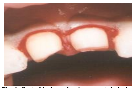
Fig. 6: Central incisors showing retracted gingiva