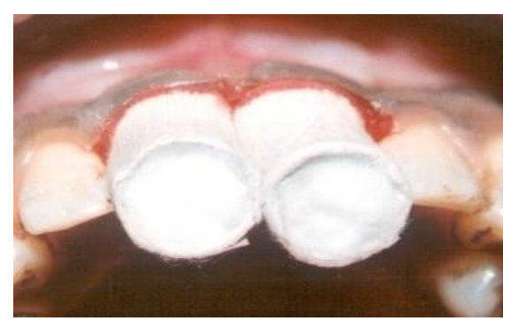
Fig. 2: Placement of blotting paper rolls on anterior central incisors packed with cotton dipped in aluminium chloride