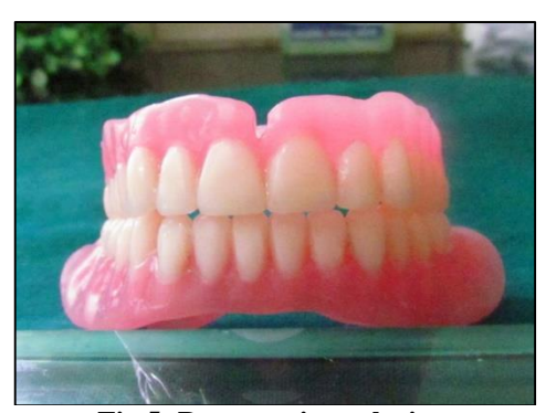
Fig.5: Dentures in occlusion