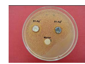
Fig.2. Antibacterial test results using Escherichia coli ATCC 25922 P<sub>1</sub>-P<sub>b</sub> treated with AgNO<sub>3</sub>, P<sub>2</sub>-P<sub>a</sub> treated with AgNO<sub>3</sub>.