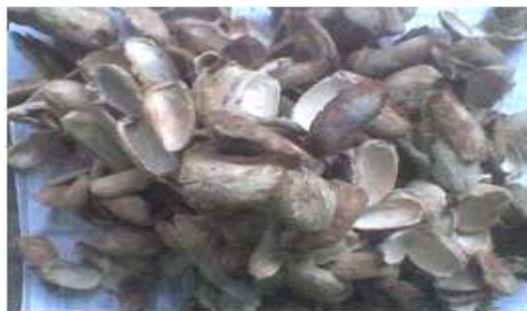
Plate 3: Groundnut Shells