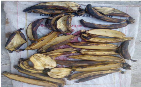
Plate 1: Fresh Plantain Peels

pure ethanol. The volume of the ethanol produced was measured with text tube. The pictorial diagrams of the plantain peels groundnut shells and corn cobs are shown in plates 1, 2 and 3.