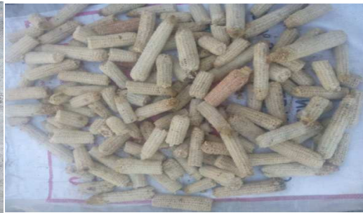
Plate 2: Corn Cobs