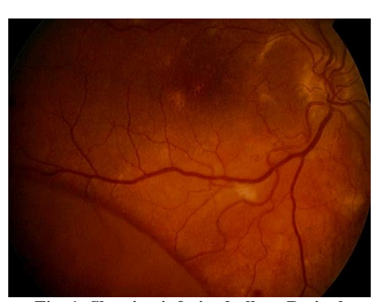
Fig. 1: Showing inferior bullous Retinal detachment in right eye.

blood pressure. An elevation of liver enzymes and creatinine were observed. The patient required a platelet transfusion. Fundus examination revealed exudative retinal detachment. Her previous antenatal records revealed no elevation of blood pressure. On examination, visual acuity with correction was 20/200 in her right eye and 20/80 in her left eye. Anterior segment examination was normal. Dilated fundus examination with indirect ophthalmoscopy and 78 D slit lamp biomicroscopy disclosed bullous, inferior, serous neurosensory retinal detachments in both eyes with shifting of fluid test positive [Fig. 1 & 2]. The only residual findings were diffuse mottling of the fundus secondary to pigmentary migration in the choroid and in the pigment epithelium of the retina disclosed by fluorescein angiography. An emergency cesarean section was done and patient was normotensive during post-partum period. Prompt recovery with good visual acuity occurred after the pregnancy ended.