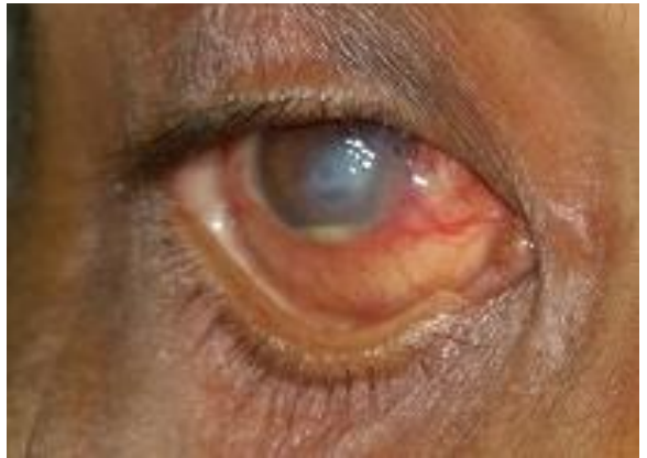
Fig. 2: Fungal corneal ulcer: Resolving stage with mild hypopyon