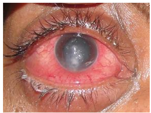
Fig. 3: Fungal corneal ulcer: corneal edema with bullae formation