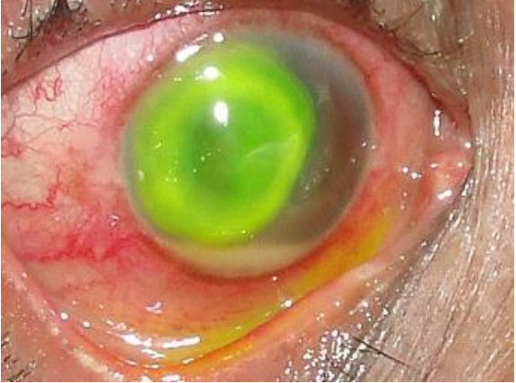
Fig. 4: Diffuse Flourescin stain positive fungal corneal ulcer with hypopyon