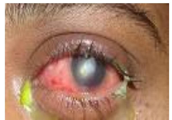
Fig. 1: Fungal corneal ulcer involving central cornea with Conjuctival congestion