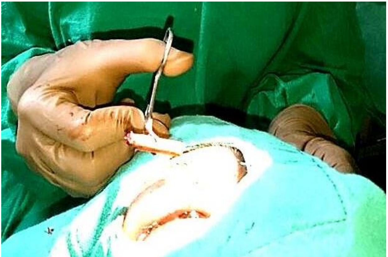
Figure 3: Surgically removed wooden foreign body.