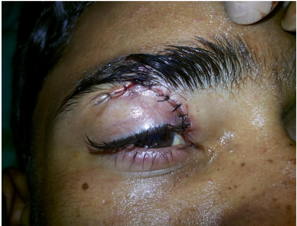
Figure 5: Immediate post-operative photograph.