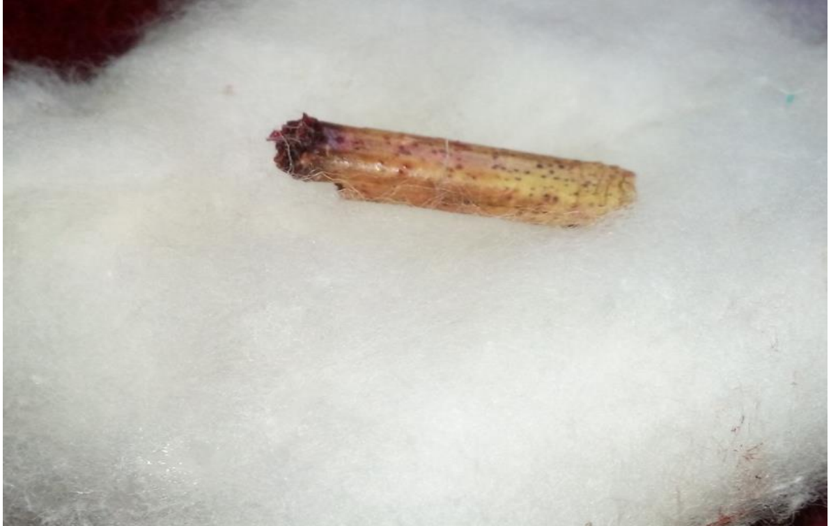
Figure 4: Image of the extracted wood