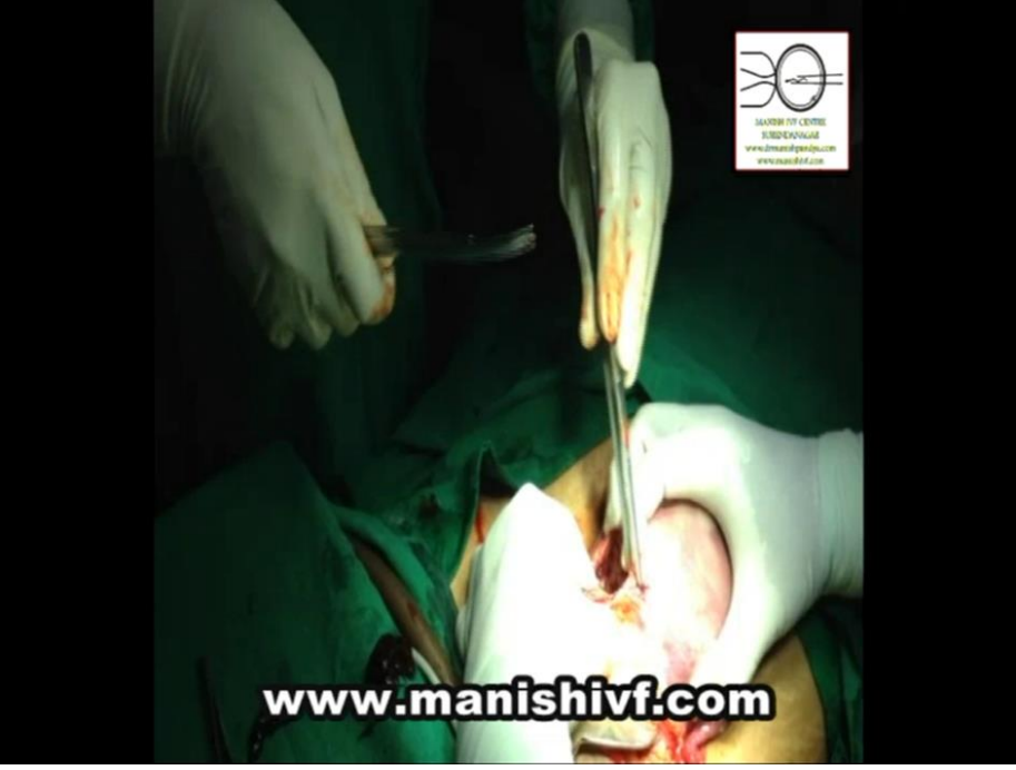
Fig. 3.2: Uterus with intact peritoneum