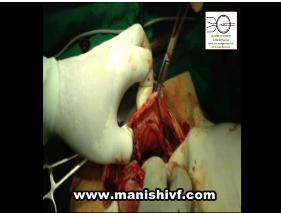
Fig. 4.1: Bladder open at fundus