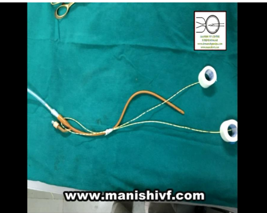
Fig. 6.1: Bilateral ureteric catheters in Foleys catheter