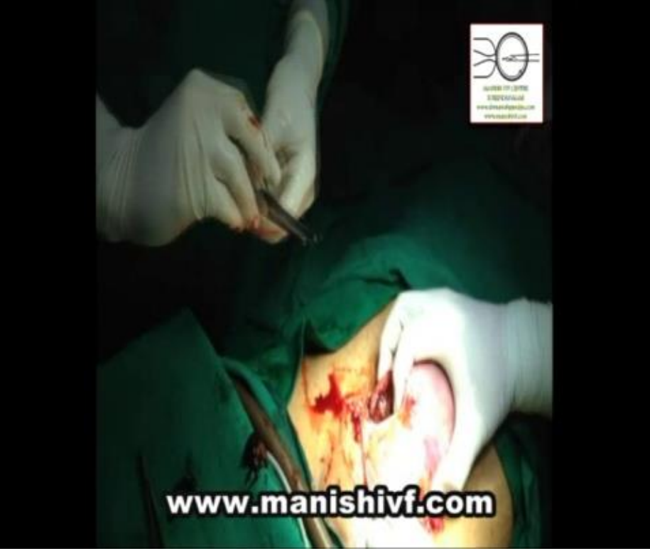
Fig. 3.1: Uterus with intact peritoneum

catheters. 7 stay sutures form one corner to another was taken with vicryl no 2.0 and kept with artery forceps (Fig 7)