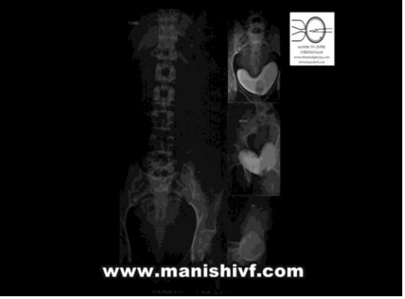
Fig. 8: Bladder Cystogram

Catheter clamping was done for one days and next day catheter removed and she had passed urine normally