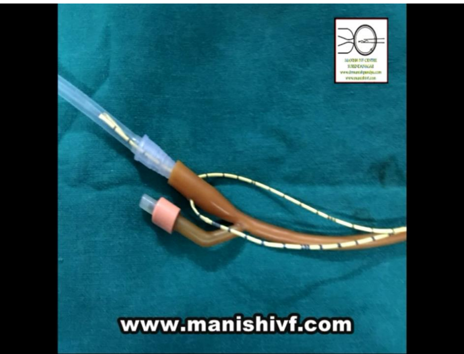
Fig. 6.2: Bilateral ureteric catheters in Foleys catheter