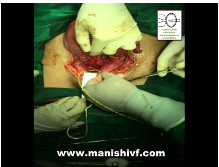
Fig. 5: Ureteric catheterization