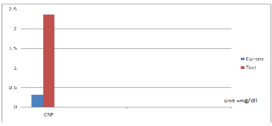
Figure 3: Mean hs-CRP values