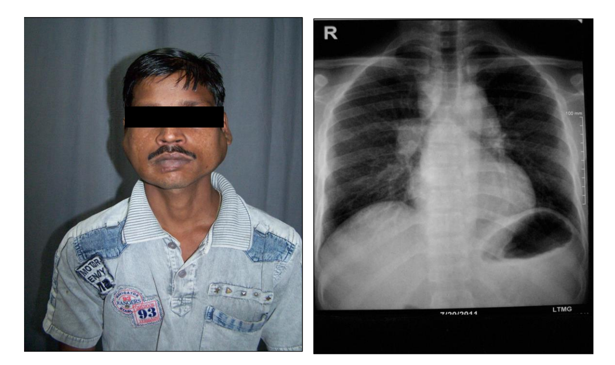
Fig1 Clinical photograph of the patient with bilateral parotid enlargement.