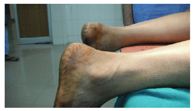
Figure 3 position on operation table

Two portals were placed adjacent to the Achilles tendon on either side. Initially a 4-mm scope is placed through the lateral portal. With a 4-mm synovial resector the soft tissue was debrided through the medial portal on the bone side and tendon side. The Achilles tendon was protected throughout the procedure by keeping the closed end of the shaver against the tendon. The bone was resected with a mastoid burr. Both the resector and scope were interchangeably used through both the portals. After resection, the Achilles tendon was inspected through scope and confirmed to be intact. At the end of the surgery, Plantarflexion of ankle was found to be satisfactory by squeeze test. Portals were closed with 2-0 ethilon (figure4)