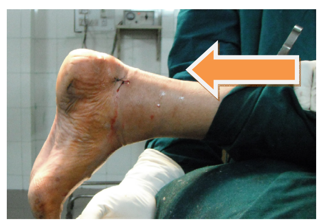
Figure 4 showing arthroscopic closure

Two portals were placed adjacent to the Achilles tendon on either side. Initially a 4-mm scope is placed through the lateral portal. With a 4-mm synovial resector the soft tissue was debrided through the medial portal on the bone side and tendon side. The Achilles tendon was protected throughout the procedure by keeping the closed end of the shaver against the tendon. The bone was resected with a mastoid burr. Both the resector and scope were interchangeably used through both the portals. After resection, the Achilles tendon was inspected through scope and confirmed to be intact. At the end of the surgery, Plantarflexion of ankle was found to be satisfactory by squeeze test. Portals were closed with 2-0 ethilon (figure4)