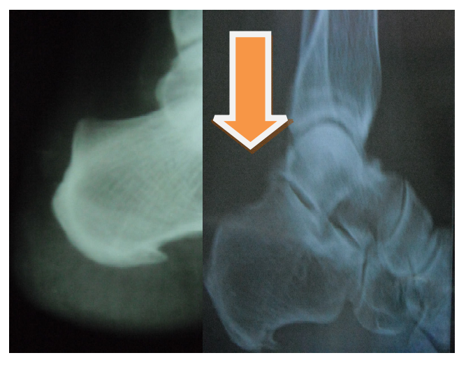
Figure 5 (left) Pre-operative x-ray showing Haglund bump and figure 6 (right) showing Post-op x-ray with removed bony bump shown by arrow head

Post operative management: Post operative period was uneventful. Patient received volar slab upto below knee extent with ankle in plantarflexion. The patient was trained for nonweight bearing mobilization till 2 weeks, and later changed to neutral position of ankle and was trained for weight bearing. By 6 weeks she returned to normal activity. X-ray showed good clearance for Achilles tendon and removal of bony swelling (Figure 5 and 6)