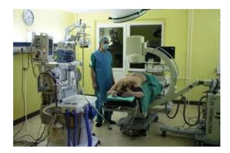
A Modern Operation Theatre with Sophisticated Monitors & Anaesthesia Delivery System.