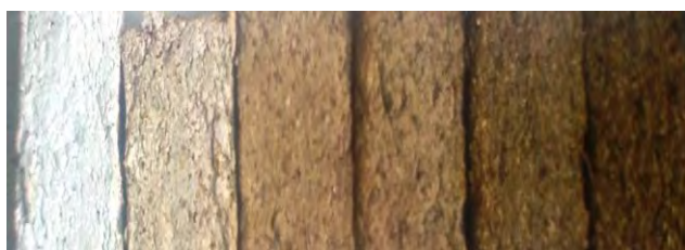
Figure 1. Comparative variation in colour of briquettes produced

Briquettes experienced larger percentage changes in the axial dimension than in lateral. Relative to the original dimensions the change in the axial direction reached up to about 9.78% compared to a maximum of about 4.56% in the lateral direction for briquettes produced with 100% waste paper. Other researchers reported a similar trend Mani et al. [12] during compaction of corn stover, Al- Widyan et al. [10] during briquetting of olive cake and Oladeji [13] during briquetting of two Species of Corn cob.